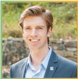
Collin O'Mara President and CEO, National Wildlife Federation

Discussion on the long-term potential of hydrogen to transform our economy, highlighting: (1) the Philadelphia region's current DOE Hydrogen Hub proposal; (2) case studies of current and future hydrogen applications; and (3) challenges in scaling the hydrogen economy. Panelists include: